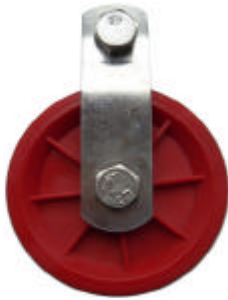
WH-101 Reinforced Nylon Pulley Ø 90 mm