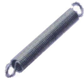
VC-345 Stainless Steel Spring for anti-roost wire