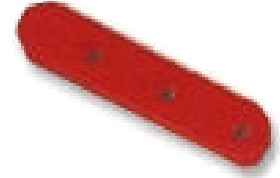
VA-001 Nylon Cord Adjustor Ø 4 mm max.