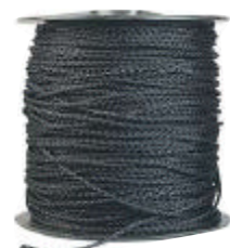
VD-321 Black Neonylon suspension cord for curtains Ø 4 mm