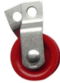
WH-102 Steel Strap Nylon Pulley Ø 47 mm