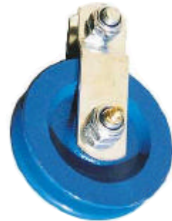
WH-125 Cast Iron Pulley with Bearing and Grease Zerk Ø 90 mm