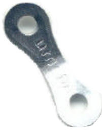
WA-341 Aluminium Cord Adjustor Ø 4 mm max.