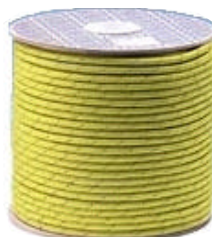
VD-320 Typtolene suspension cord feeding systems Ø 6 mm