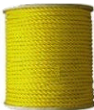
VD-319 Neonylon suspension cord drinker systems Ø 4 mm