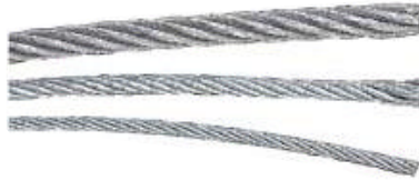
Wire Rope Cable Galvanised / St. Steel Ø 1.5 - 4- 5 mm