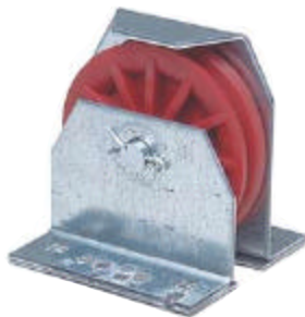
WH-190 Corner Reinforced Nylon Pulley Vertical Ø 90 mm