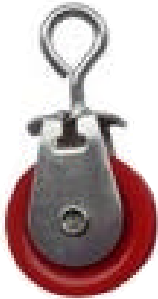
WH-104 Swivel full case Nylon Pulley Ø 47 mm