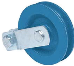
WH-100 Cast Iron Pulley Ø 90 mm