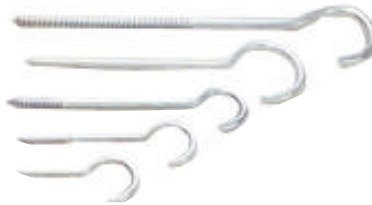
Screw hooks - 7 models Ø 7 mm - 60-80-90-120-160-200 mm long