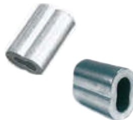
VC-116 Aluminium Cable Sleeve Ø 1/16" - 1.5 mm