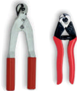
Wire Cable Cutters 2 models