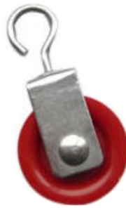
WH-103 Yoke Nylon Pulley Ø 47 mm