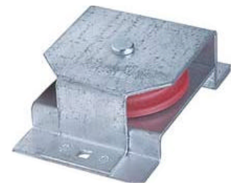
WH-191 Corner Reinforced Nylon Pulley Horizontal Ø 90 mm