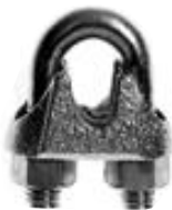
GN-375 Iron Wire Clip 3/16" DIN 1142