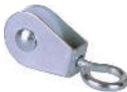
WH-107 Curtain Nylon Pulley Ø 25 mm